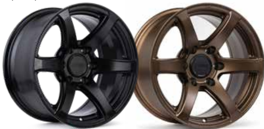
Matte Black (BK)