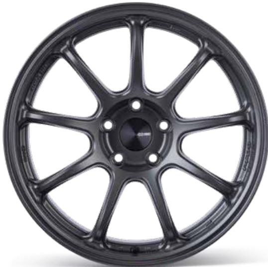
Matte Gunmetal / front angle (GM)