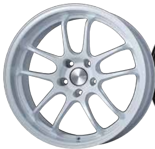
Pearl White (WP)