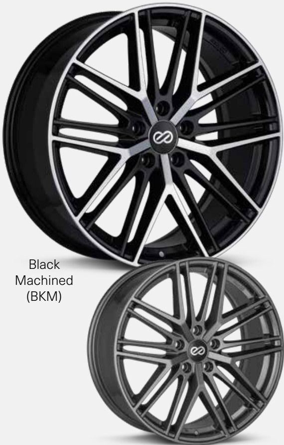
Black Machined (BKM)