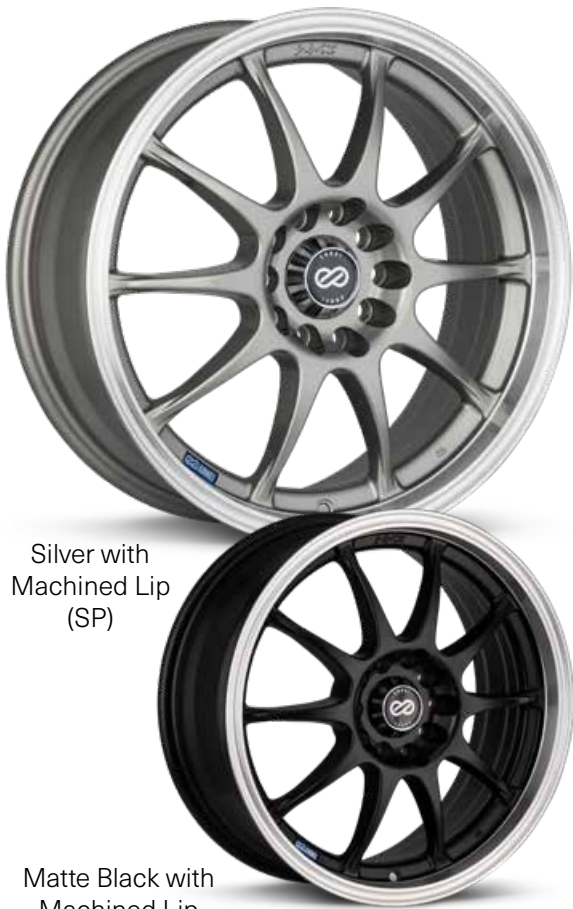
Silver with Machined Lip (SP)