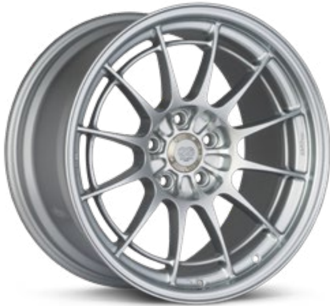
F1 Silver (SP)