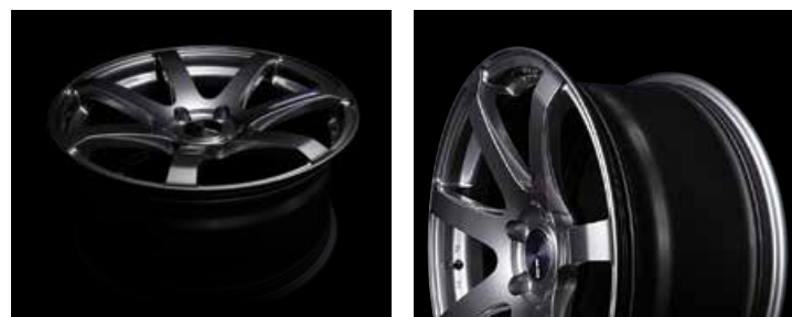
Dark Silver (DS)

Seven dynamic spokes reach toward the edge of the flange in a concave fashion to give the wheel additional depth and the appearance of being one size larger. The sides of the spokes are thinned to make them lighter while emphasizing the concave shape. This is combined with a double-lipped flange for an especially aggressive look. The concepts of toughness and sport serve as inspiration for these design features. The wheel's rim is formed with MAT technology to achieve a high level of strength, rigidity, and light weight. The face is engineered to accommodate a large brake caliper and to enhance brake cooling performance during high speed driving.