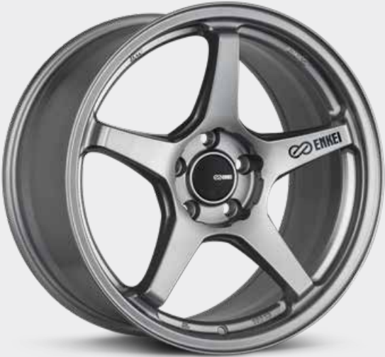
Storm Gray (GR)