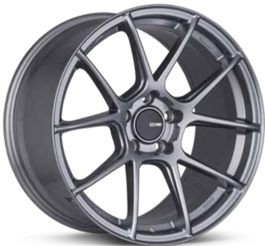
Storm Gray (GR)