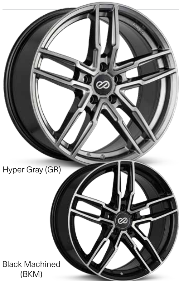
Hyper Gray (GR)