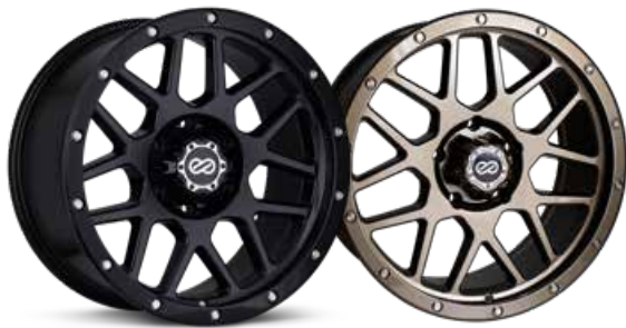
Gloss Black (BK)