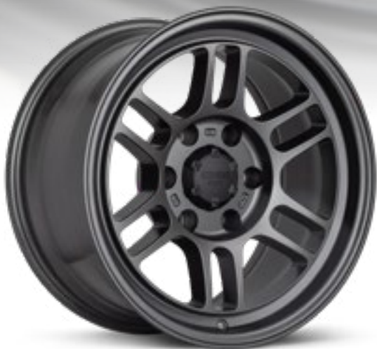
17x9 w/cap Matte Dark Gunmetal (GM)