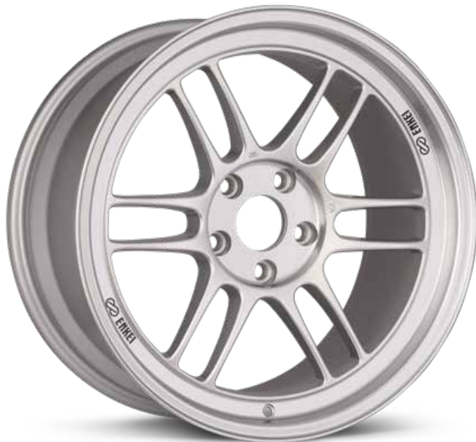
F1 Silver (SP)