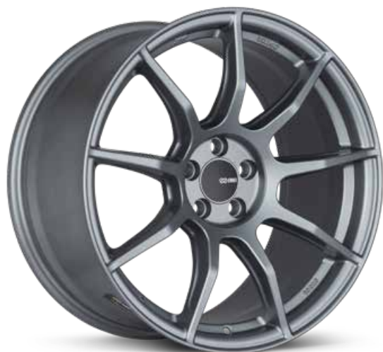
Platinum Gray (GR)