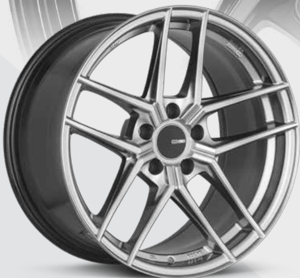
Hyper Silver (HS)

The Enkei TY-5 is an exciting entry in Enkei's lightweight Tuning series. Utilizing a sleek combination of a split 5-spoke style with the center styling cues of a mesh wheel, the TY-5 is a great choice for a wide variety of wheels ranging from small sports coupes to full-size luxury cars. It is available in several exciting colors including hyper black, gloss black, and an all-new limited pearl black. The TY-5 is available in concave and flat face profiles dependent on size and width, and includes Enkei's signature flat center cap.