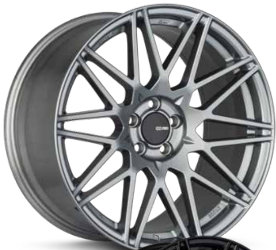
Storm Gray (GR)