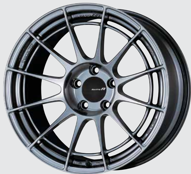
Hyper Silver (Limited Sizes / Special Order)

Another Enkei Racing legend has received an RR makeover with Enkei's latest MAT DURA II flow forming rim, the NT03RR. The wheel's iconic brace ring evenly distributes stresses on spokes to help rim rigidity even further, giving NT03RR superb cornering and steering response capabilities. Dynamic design with concave rear face offers a beautiful, yet powerful form to complete any true racing setup. The NT03RR is offered in sizes ranging from 17x7 all the way up to 18x11 with a variety of bolt patterns and concaveness profiles. Available in three different concave faces.