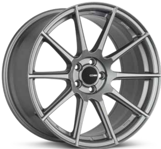
Storm Gray (GR)