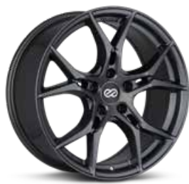
Gloss Anthracite (AP)

The Enkei Vulcan Performance wheel is the perfect choice for those wanting to add bold style to their sporty coupes, sedans, and crossovers. The Vulcan's unique split spoke design starts with pockets around the center that are not only a styling cue, but a design feature that also helps reduce the weight of the wheel.