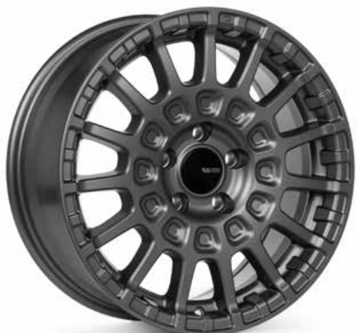
Matte Gunmetal (GM) (Special Order)