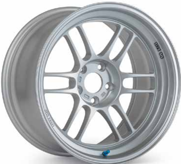
F1 Silver (SP)

MOST ADVANCED TECHNOLOGY Enkei developed a new manufacturing process to produce the next generation of aluminum wheels. Most Advanced Technology (MAT) combines one-piece cast wheel technology with a rim-forming "spinning" technique. Use of this new technology of casting and rim forming, is critical to drastically improve the material properties and strength of wheels. In addition, Enkei's rim-rolled technology shapes the rim to improve material elongation without sacrificing the wheel's hardness.