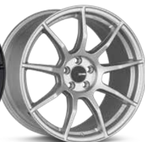
Matte Silver (SP)