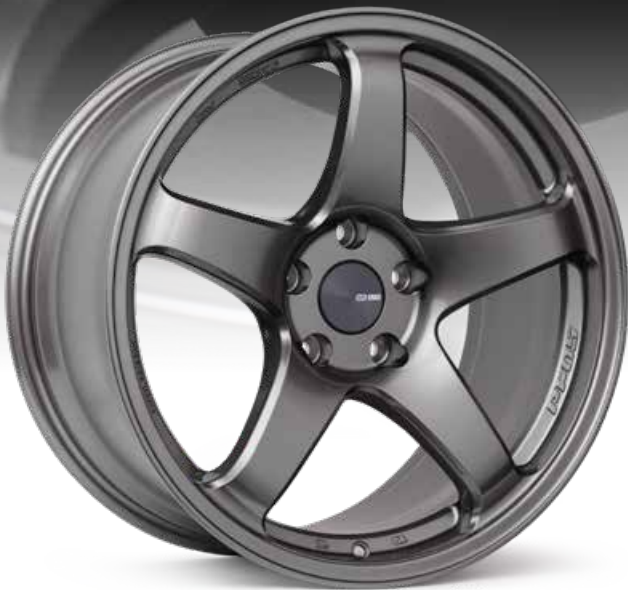
Dark Silver (DS)