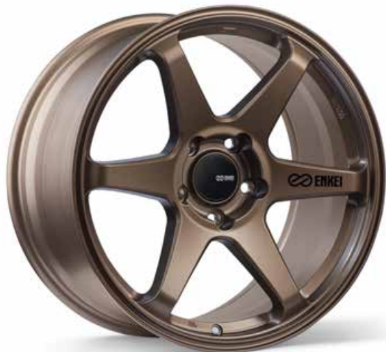
Matte Bronze (ZP)