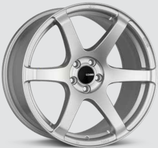
Matte Silver (SP)