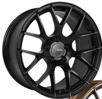
Matte Black (BK) (Shown with optional flat cap)