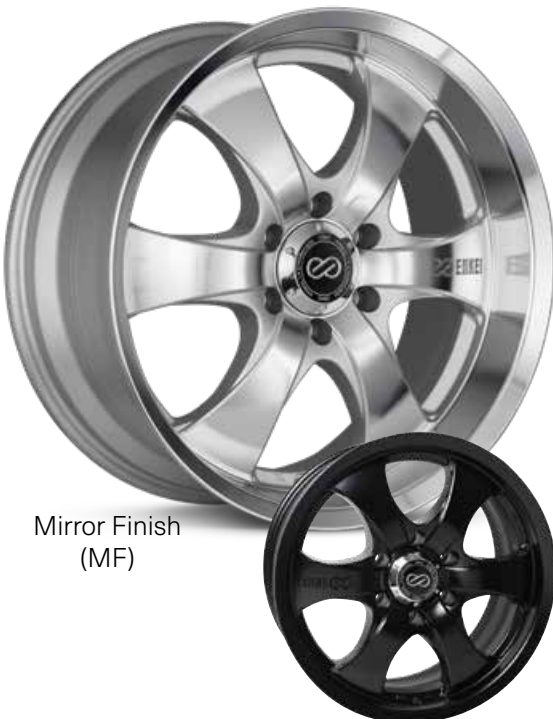
Mirror Finish (MF)