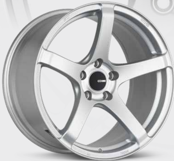
Matte Silver (SP)

The KOJIN takes the traditional 5-spoke design and adds just the right contours to give it an aggressive tuner look without being too loud about it. The KOJIN is built using Enkei's original MAT technology to achieve the ultimate in strength and light weight. The Enkei KOJIN is where art and science meet to create the next big step forward in wheels.