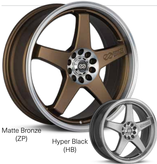
Matte Bronze (ZP)