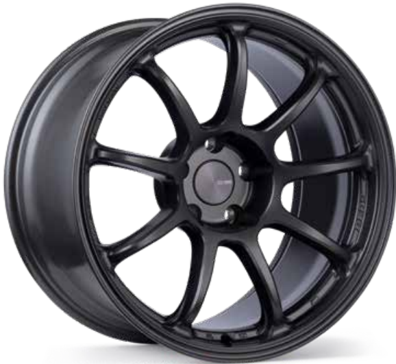
Matte Gunmetal (GM)