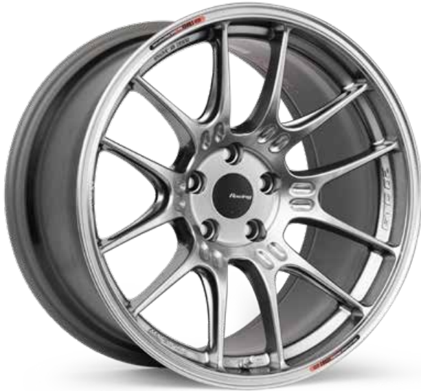
Hyper Silver (HS)