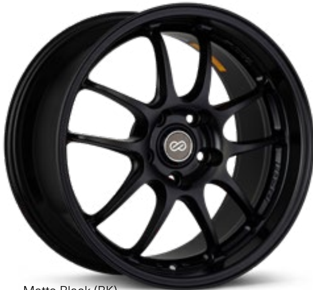
Matte Black (BK)