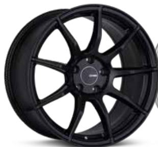
Matte Black (BK)