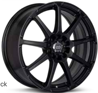
Matte Black (BK)