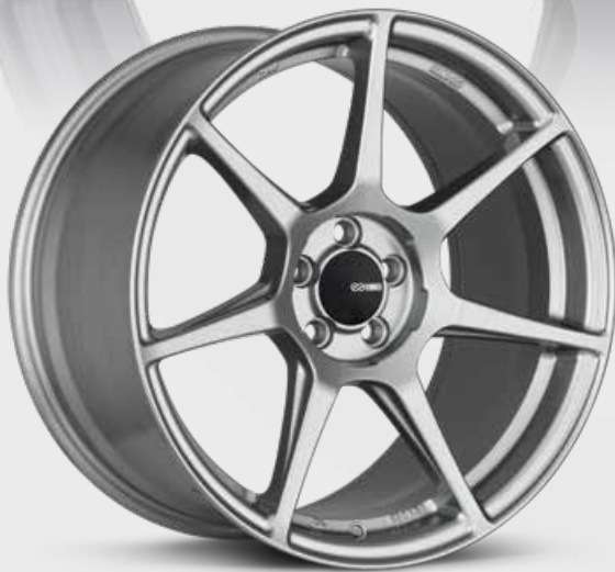
Storm Gray (GR)

Simplify and add lightness. That's the approach Enkei has taken with the TFR Tuning Series wheel. Seven perfectly contoured spokes start from a center with carefully placed cuts to save every ounce possible. The TFR is the wheel you can autocross with on the weekends and drive to work with during the week. It is truly versatile. The TFR is available in 17", 18", and 19" sizing in all new Copper, Storm Gray, and limited Gunmetal finishes. The wheel is finished off with Enkei's signature flat center cap.