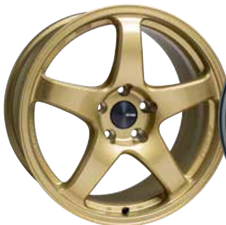
Gold (Special Order)