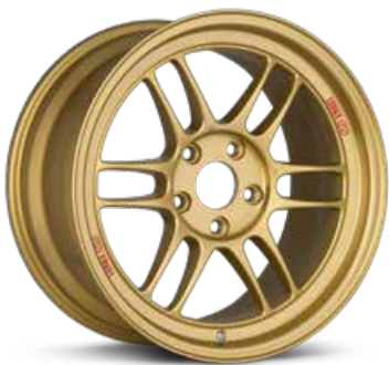
Gold (GG) (Limited Sizes)