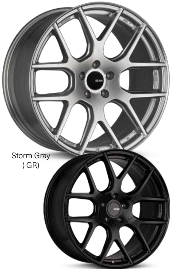
Storm Gray (GR)