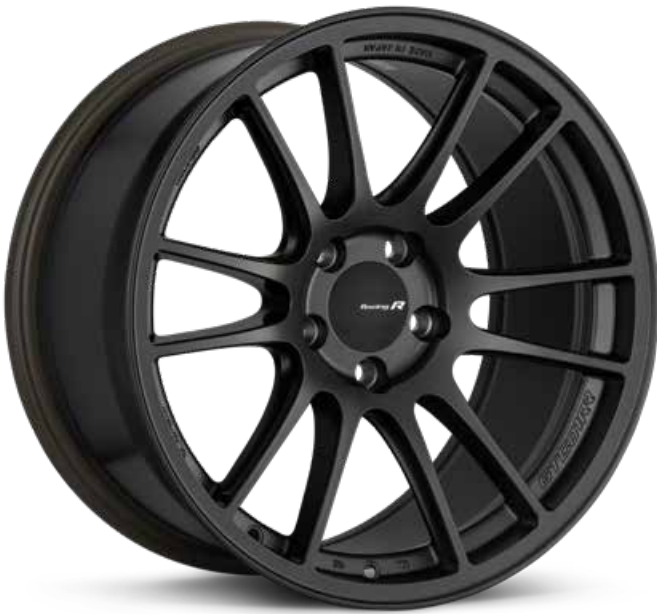
Matte Gunmetal (GM)