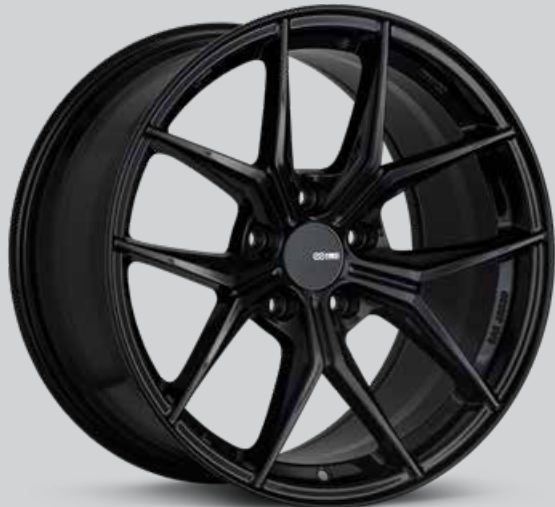
Gloss Black (BK)

Cap# A476-CAPBK, Cap# for 5x120 BMW size, Cap# A476-CAPBK BMW