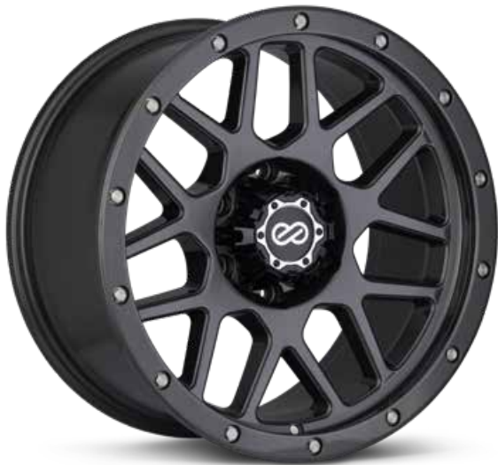
Gloss Gunmetal (GM)