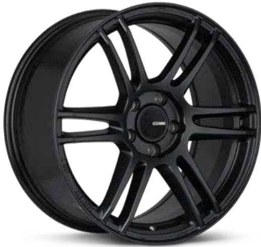
Matte Black (BK)