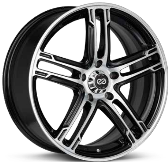
Black Machined (BKM)