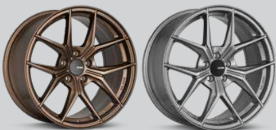
Gloss Bronze (ZP)