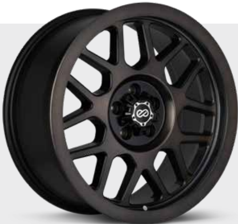
Brushed Black (BB) (17" only)