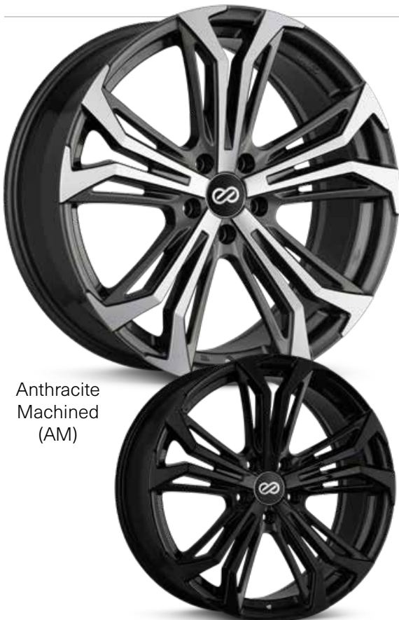
Anthracite Machined (AM)