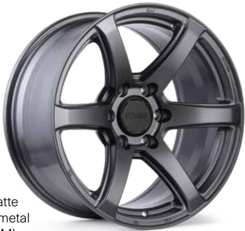
Matte Gunmetal (GM)

Introducing Enkei's Truck Series. While Enkei is most well known for its high-performance car wheels, it is proud to offer a range of wheels designed for trucks and SUV's as well. Enkei has applied its unrivaled engineering capabilities to come up with several designs that will stand up to the tough demands that truck and SUV drivers place on their wheels. Utilizing Enkei's world class manufacturing facilities and emphasizing function over flare, the Enkei truck series offers a great way for truck and SUV owners to add some styling to their vehicle, while maintaining the tough and rugged capabilities they count on from their wheels.