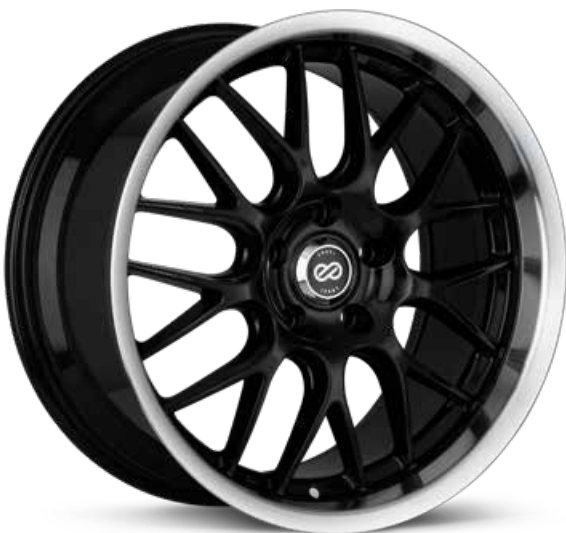
Black with Machined Lip