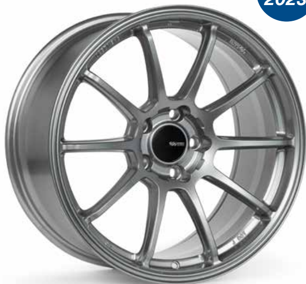
Storm Gray (GR)