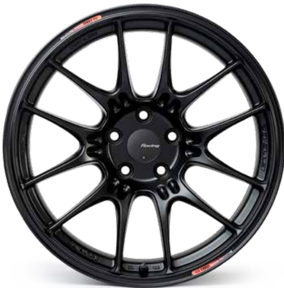
Matte Black (BK)

Visit Enkei.com for cap part numbers Each GTC02 includes two Racing Prototype stickers Valve Stem# V429-0000SP for Hyper Silver, V429-0000BK for Black