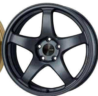
Matte Gunmetal (Special Order)