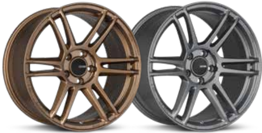
Matte Bronze (ZP) Titanium Gray (GR)