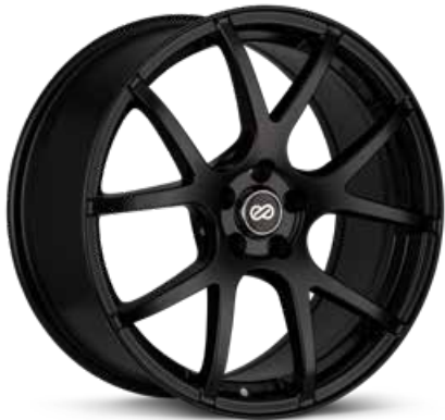
Matte Black (BK)