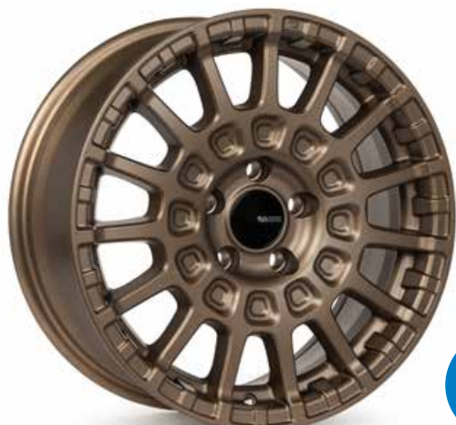
Matte Bronze (ZP)

Introducing Enkei's Performance Series. The Enkei performance series represents the absolute best combination of styling, performance, and value in the aftermarket wheel business today. Enkei's expert engineering and world-class manufacturing allow us to offer high quality wheels in a wide range of vehicle applications without breaking the bank.