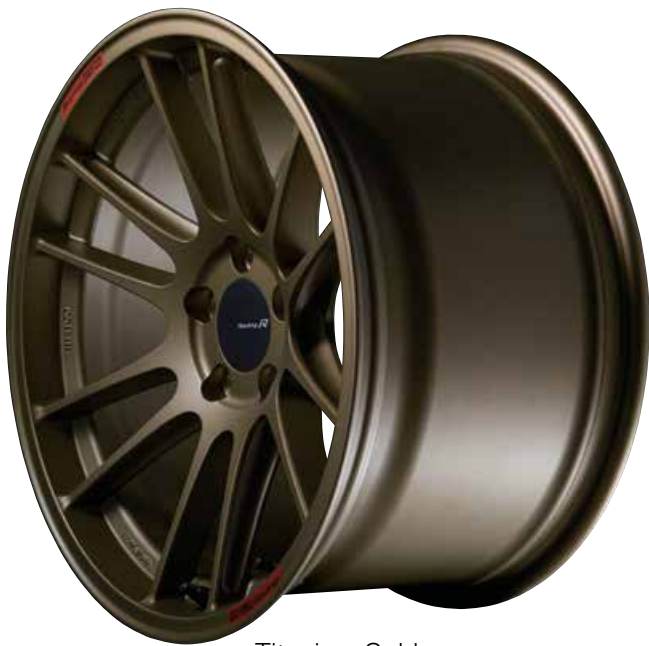
Titanium Gold (Limited Sizes / Special Order)