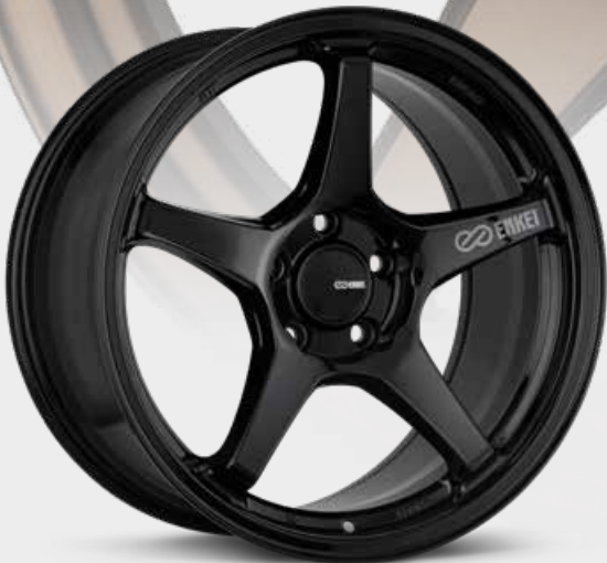
Gloss Black (BK)

The lightweight Enkei TS-5 is sure to be an instant classic in the tuning world. The TS-5 is the wheel that will have everyone admiring it at a loss for words because it just does everything right. It is remarkably simple and clean, relying on the tried and true 5-spokes and a lip formula, but the TS-5 gets the aesthetics just right. It is the golden ratio in wheel form. It screams motorsports and whispers class at the same time. It is just as much at home on track as it is on the street. With 17" and 18" sizing and widths up to 9.5", the TS-5 will suit a remarkable variety of sport sedans and coupes.