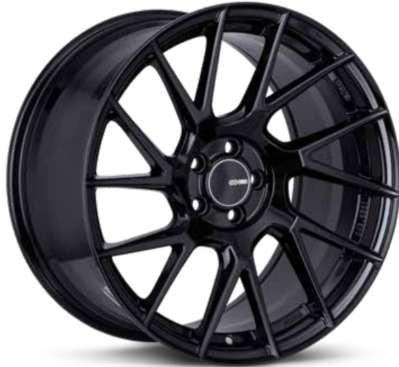
Gloss Black (BK)