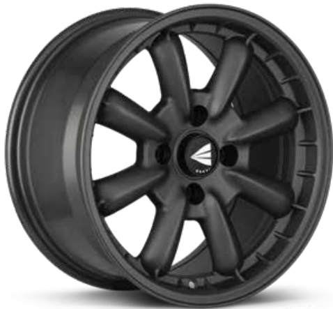
Matte Gunmetal (GM)