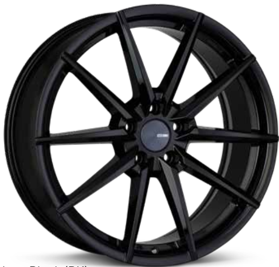
Gloss Black (BK)