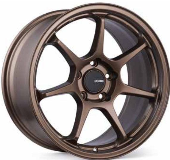
Matte Bronze (ZP)