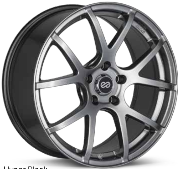
Hyper Black (HB)