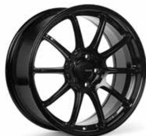
Gloss Black (BK)