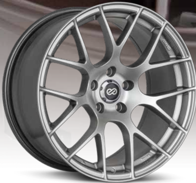
Hyper Silver (HS)