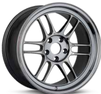
SBC (Limited Sizes)