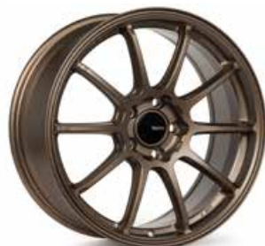
Matte Bronze (ZP)

The all-new Triumph is a ten-spoke lightweight wheel made using our MAT process, the same MAT process used to make the Enkei RPF1. Using our MAT Technology process creates a lightweight wheel while drastically improving the material property and strength of the wheel. The ten sleek spokes give the Triumph a sporty lightweight profile that is commonplace on race tracks across the globe. The Triumph is an ideal option for modern sports coupes and sedans like the Toyota 86 and BRZ, the Civic Type R (FK), Subaru WRX, IS250/300, Nissan Z34, and many others.