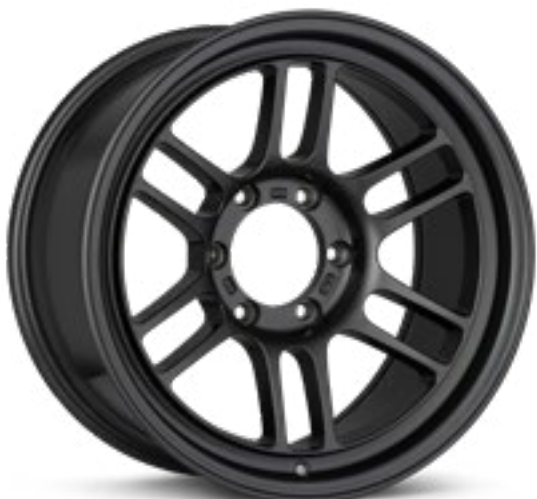
Matte Dark Gunmetal (GM)