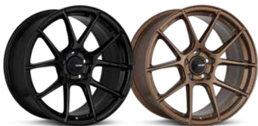
Gloss Black (BK) Gloss Bronze (ZP)