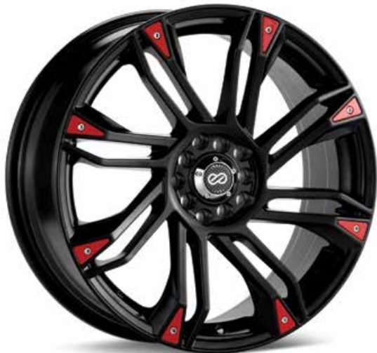
Matte Black with Red Trim (BK)