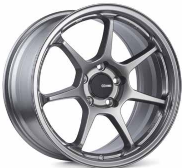
Storm Gray (SP)