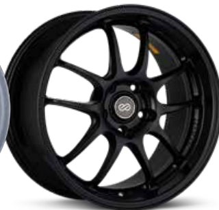
Matte Black (BK)