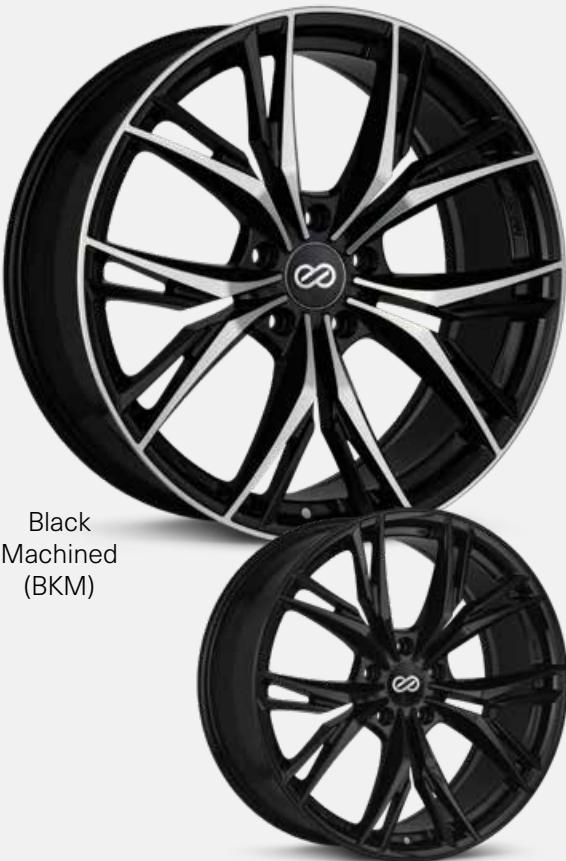
Black Machined (BKM)