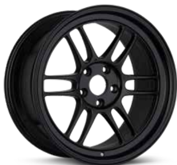
Black (BK) (Limited Sizes)