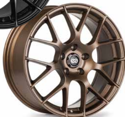
Matte Bronze (BP)