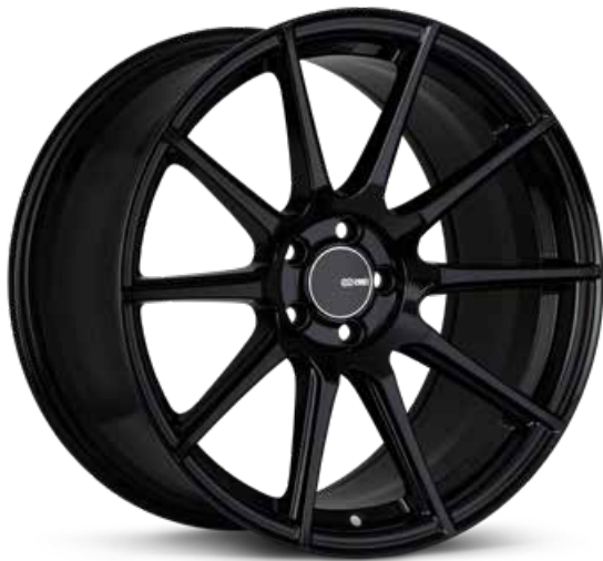
Gloss Black (BK)