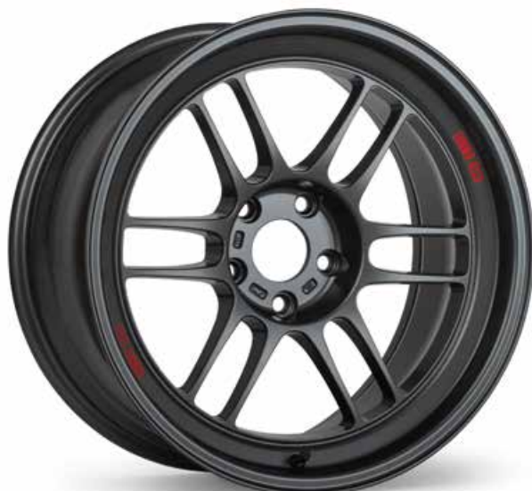
Dark Gunmetal (GM)