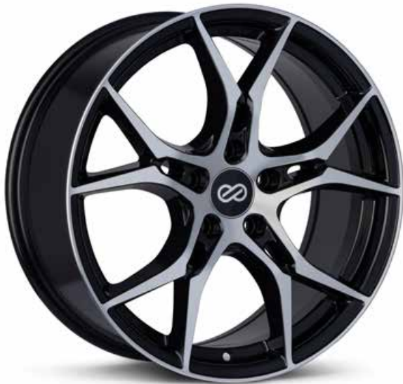
Black Machined (BKM)