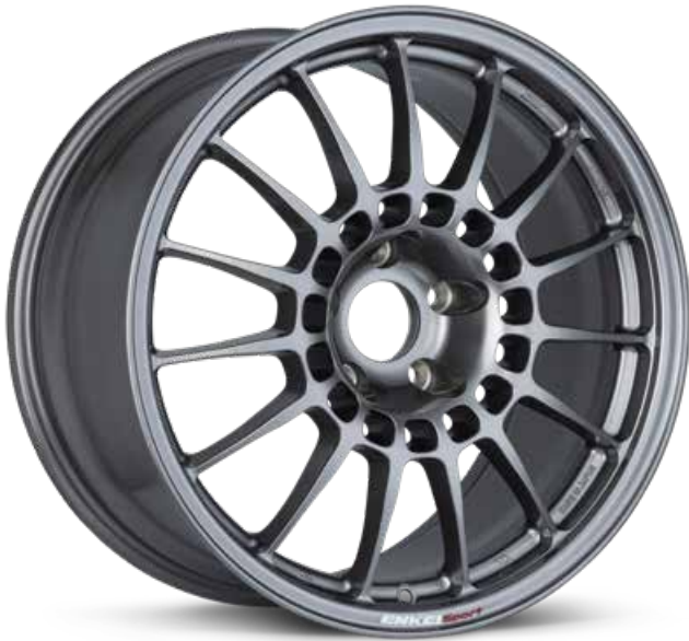
Dark Silver (DS)