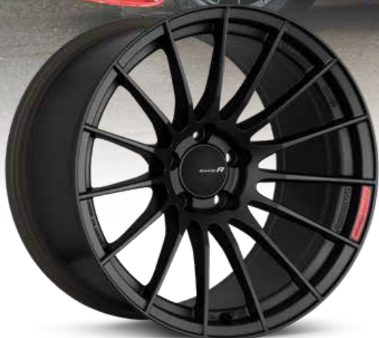
Matte Gunmetal (GM)

Designed to look incredible while retaining Enkei's racing spirit & functionality. The light weight RS05RR is made using Enkei's MAT-DURA flow forming method. With the RS05RR, there's no need to choose between form or function, you can simply have both. Made in 18x8.5-18x11 with 3 different concave face designs. Available in a Matte Gunmetal finish.