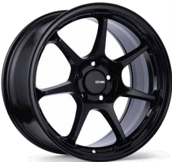
Gloss Black (BK)