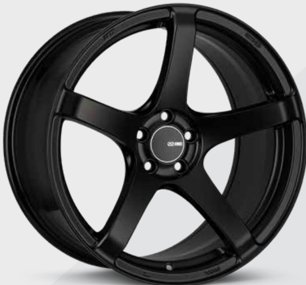
Matte Black (BK)