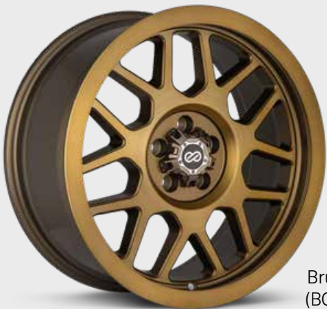
Brushed Gold (BG) (17" only)