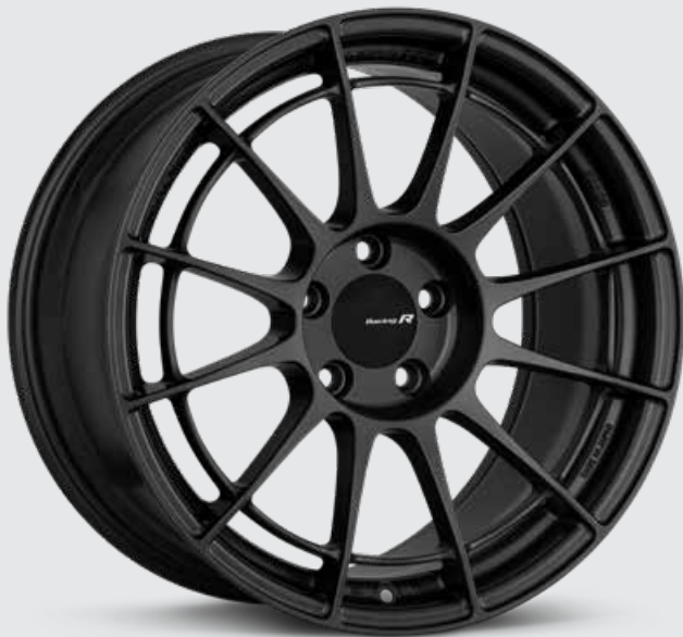
Matte Gunmetal (GM)