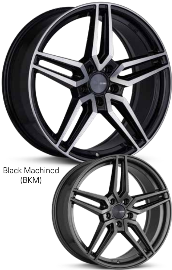
Black Machined (BKM)