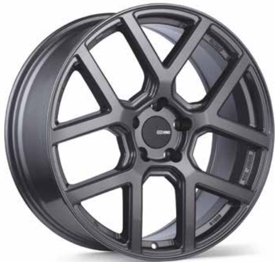
Gloss Gunmetal (GMH)